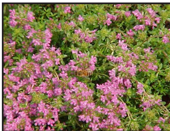
Figure 1. red-flowered creeping thyme ( thymus praecox ssp. arcticus 'Coccineus')

loosestrife ( Lythrum spp.) mallows ( Malva spp.) marsh marigold, cowslip ( Caltha palustris ) Miami mist ( Phacelia purshii ) mock orange ( Philadelphus coronaria ) money plant ( Lunaria annua or L. biennis ) motherworts ( Leonurus cardiaca & L. sibirica ) New Jersey tea ( Ceanothus americanus ) Onions, garlic, chives ( Allium spp.) phacelia ( Phacelia spp.) plums, peaches, apricots, cultivated cherries ( Prunus spp.) potentilla or cinquefoils ( Potentilla spp.) privets ( Ligustrum spp.) purple coneflower ( Echinacea purpurea ) raspberry ( Rubus idaeus ) redbud ( Cercis canadensis ) roses (occasionally some wild or near-wild types are attractive, Rosa spp.) Russian olive ( Elaeagnus angustifolia ) sages or salvia ( Salvia spp. most types but usually not red-flowered) sand cherry ( Prunus cistena ) Siberian peashrub ( Caragana arborescens ) smartweeds ( Polygonum spp.) speedwells ( Veronica spp.) spireas, ( Spirea spp.) St. John's-worts ( Hypericum spp.) strawberries ( Fragaria spp.) sumacs (including poison ivy) ( Rhus spp.) thistles ( Cirsium spp.) thymes ( Thymus spp.) tulip poplar ( Liriodendron tulipifera ) viper's bugloss ( Echium vulgare ) weigela ( Weigela florida ) white clover ( Trifolium album ) wild mustards & cresses yellow sweetclover ( Melilotus officinalis )