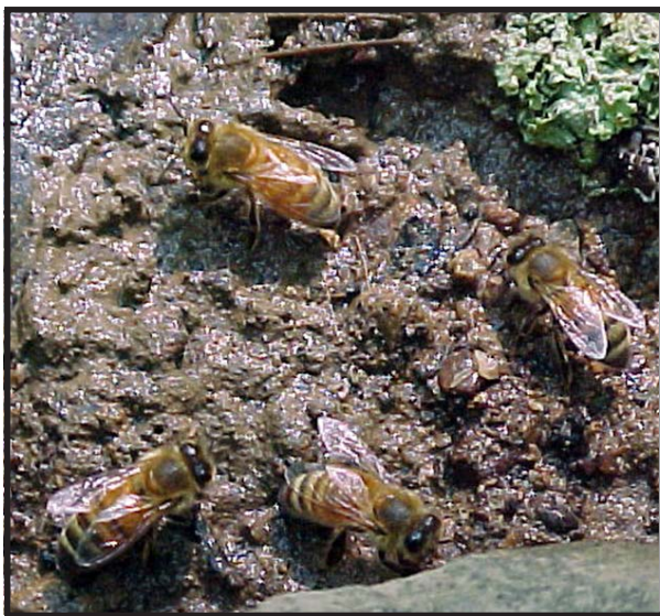
Figure 1. Water collectors in mud slurry

Just as with nectar and pollen foraging bees, all water collectors will not necessarily go to your water source. Some of the foragers are probably searching for sources of trace elements and minerals that clean water would not provide. But providing a convenient, clean water supply is a simple thing that beekeepers can do to help their colonies be successful.